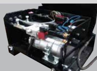
HIGH PERFORMANCE POWERPACK

Cylinders fitted with protection cover which prevents scratching on rod and reduce damage of seal