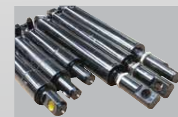
DURABLE HYDRAULIC CYLINDERS

Comes with 4 cylinders for heavy-duty and stable operation 2 single-acting lifting cylinders fitted with safety valves 2 single-acting tilting cylinders Serviceable to help reduce maintenance cost