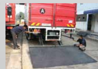
AFTER SALES SERVICE

Provides an optional hands free method to control the tail lift platform. Requires both feet to initiate the movement and release of any control will stop the movement. This safety feature will prevent unintentional movement of platform.