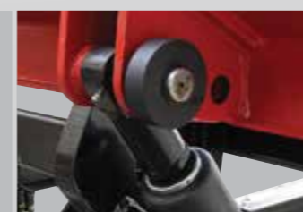
HEAVY-DUTY PLATFORM ROLLERS

Heavy duty UV protected PVC for maximum durability High-strength reflective strips for high visibility and maximum safety