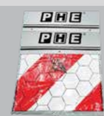
SAFETY WARNING FLAGS

Simple push buttons Cut-off switch with key Motor with thermal safety device